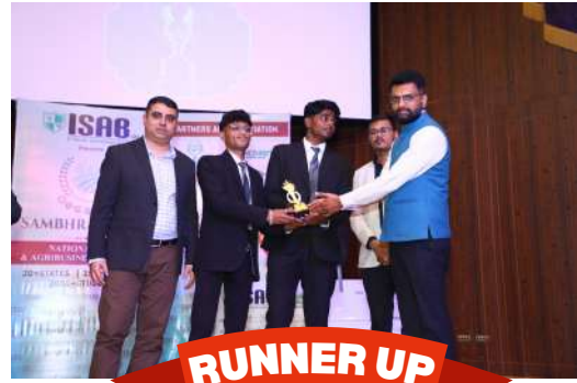
TEAM CHAYA (ISAB, GREATER NOIDA)