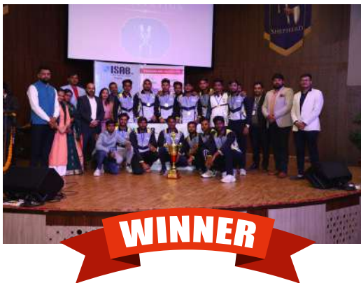
JAGANNATH UNIVERSITY, JAIPUR