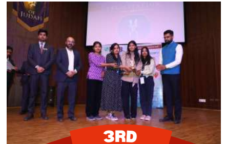
TEAM BREAK THE BREAK (COLLEGE OF AGRICULTURE, DHULE)