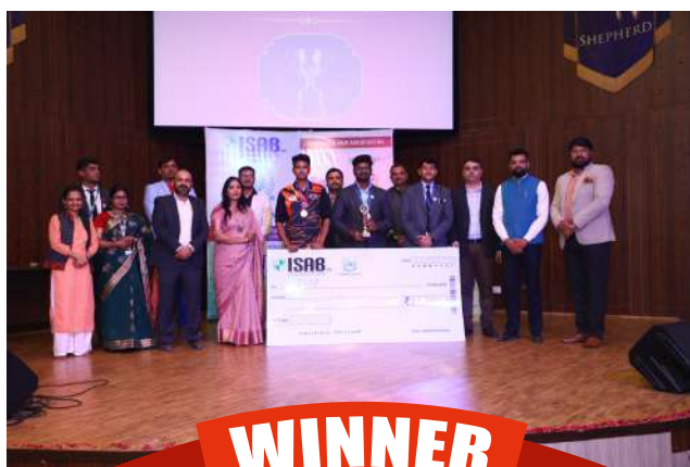
TABLE TENNIS TOURNAMENT

IMPERIAL SCHOOL OF AGRI BUSINESS, GREATER NOIDA