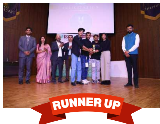
BIHAR FOLK DANCE (TEERTHANKER MAHAVEER UNIVERSITY, MORADABAD)