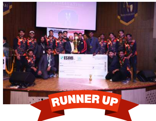
IMPERIAL SCHOOL OF AGRI BUSINESS, GREATER NOIDA