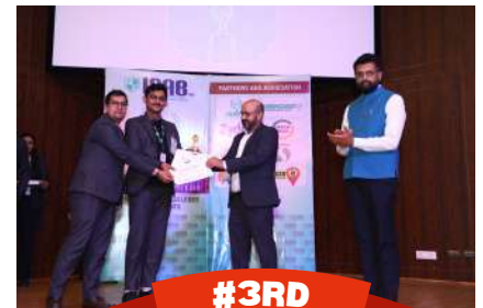
TEAM BIRSAIANS (BIRSA AGRICULTURAL UNIVERSITY, RANCHI)