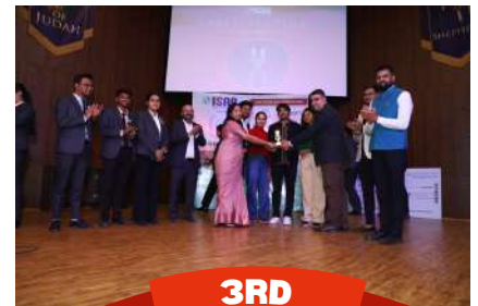
TEAM BAAZIGAR (IABM, BIKANER)