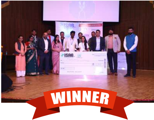
MALLA REDDY UNIVERSITY, HYDERABAD