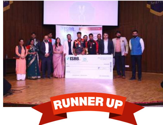
IMPERIAL SCHOOL OF AGRI BUSINESS, GREATER NOIDA