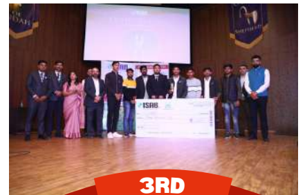
TEAM THE TREND MAKER (SARDAR VALLABHBHAI PATEL UNIVERSITY OF AGRICULTURE AND TECHNOLOGY)